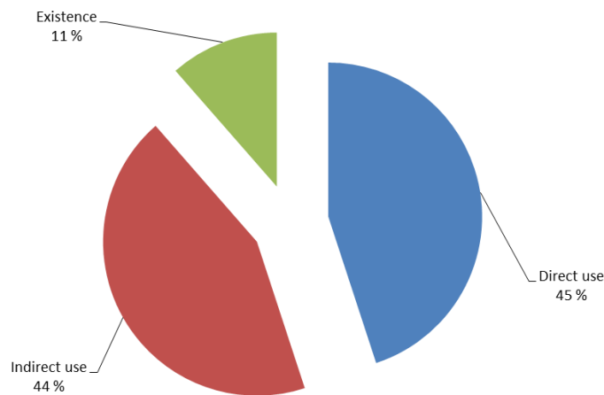
Figure 1. Classification of ecosystem services in the Divici-Pojejena wetland area and their relative contribution.

In its current state, the Divici-Pojejena wetland is a source of direct and indirect use values, as well as of non-use existence benefits (Figure 1). Due to the several restrictions in the area, the direct use values are limited to bird watching and amenity services. Indirect uses, however, are more diverse and include flood control, water filtration and groundwater recharge, storm protection and erosion control. The non-use and existence benefits in the wetland relate to its biological diversity and in our case are captured by the habitat services.